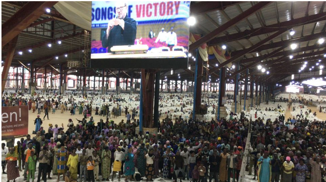
Some of the many that came forward to rest in God's presence on Saturday morning (above)