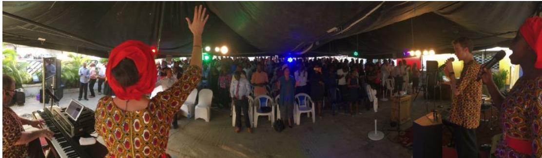
The team ministering at the morning outreach (above)

One of the highlights of our week in Lagos was our time of ministry at RCCG House of Gideons. They run an outreach in the morning from 6.30am – 7.45am for people to come and worship before they go to work.