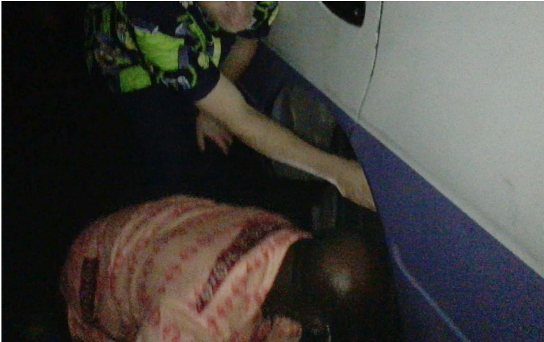
Changing the flat tyre in the dark (above)