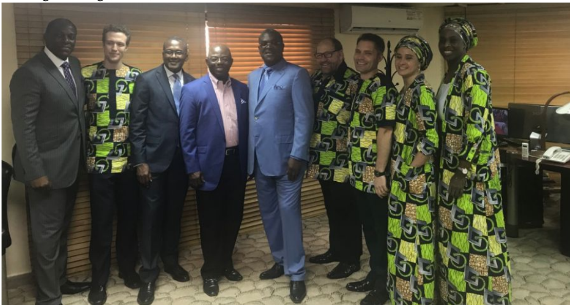
Vinesong pictured with the pastors and elders of City of David after arriving for the Sunday morning meeting (below)