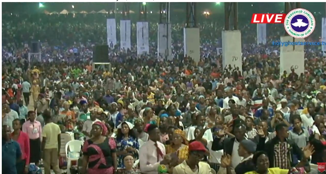
A small fraction of the hall in Abuja (bottom)

The new RCCG hall in Abuja seated around 500 000 worshippers eager to call down the fire of the Holy Spirit into their homes and lives, something that we as a team deeply long to see and experience wherever we go. As a confirmation on the day of Pentecost, Peter quoted the prophet Joel in Acts 2:17 where God declared that in the last days, He will pour out of His Spirit upon all mankind.