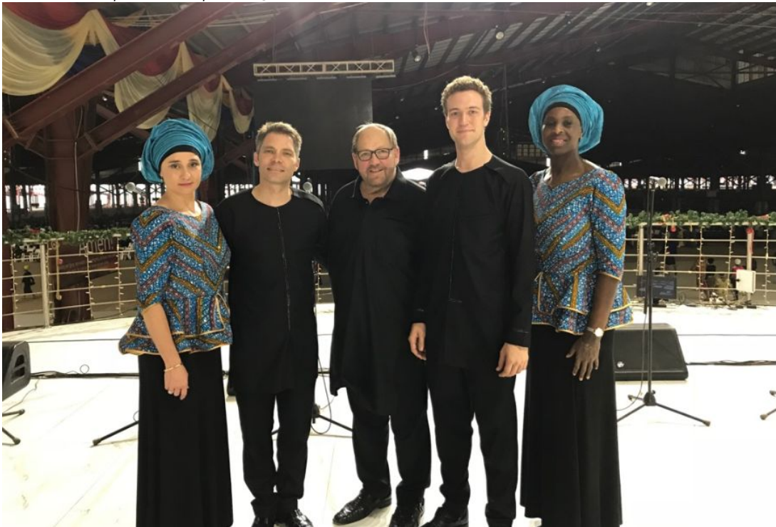
At the old auditorium (1.5km by 1km) before the first ministry on Monday (above)