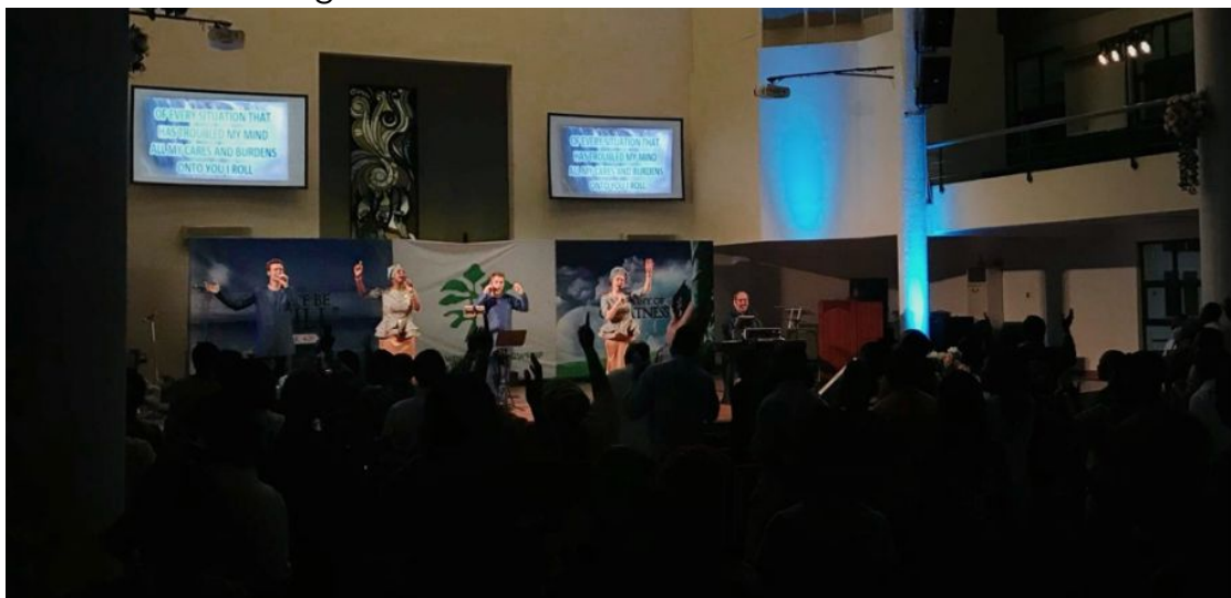
Vinesong at Olive Tree Parish (above)

We ministered at Olive Tree parish, where the former senior pastor is now the Vice President of Nigeria.