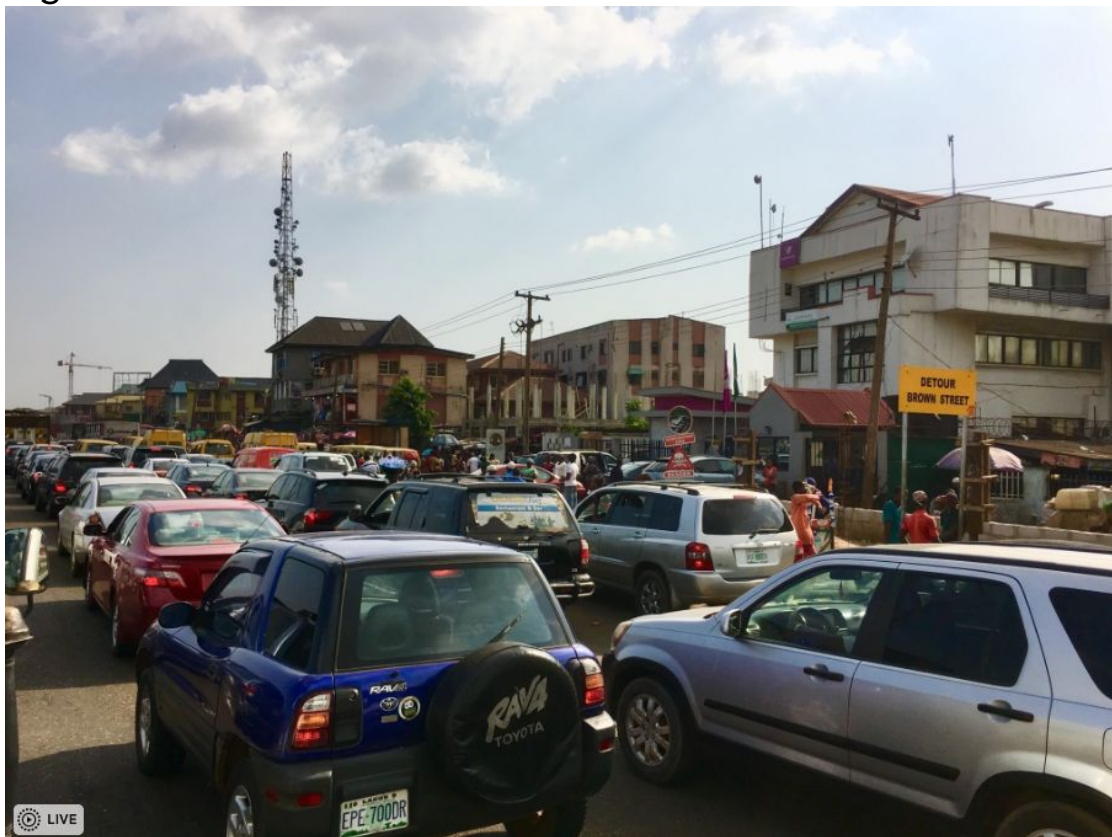
A traffic jam in Lagos (above)