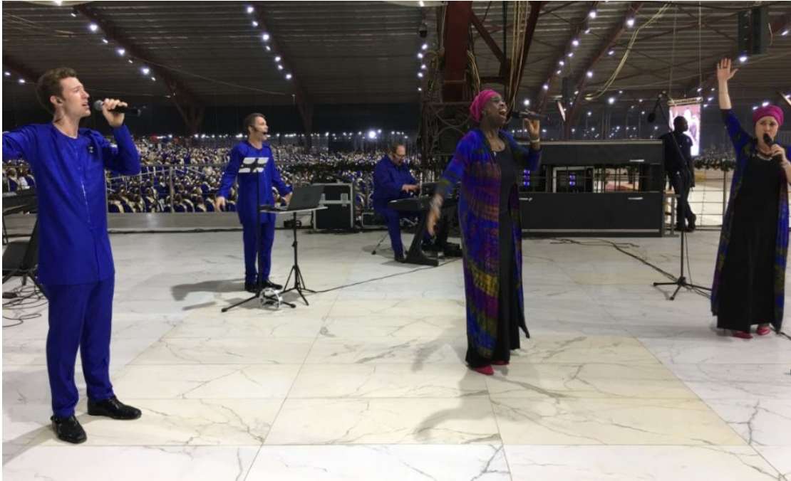
Vinesong singing "Our God Reigns" with the 7,500 man choir at the 3km by 3km auditorium at the Redemption Camp in Nigeria (above)